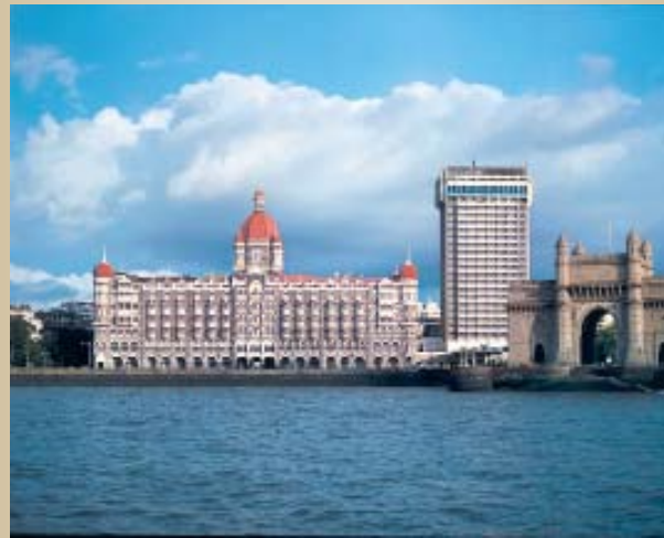
View over the Arabian Sea

Since it opened in 1903, the Taj Mahal Palace & Tower has become a gracious landmark of the city. This architectural marvel brings together Moorish, Oriental and Florentine styles and has panoramic views of the Arabian Sea and the Gateway of India. Over the past century, the hotel has amassed a diverse collection of paintings and works of art and is a veritable showcase of artifacts and art of the era.