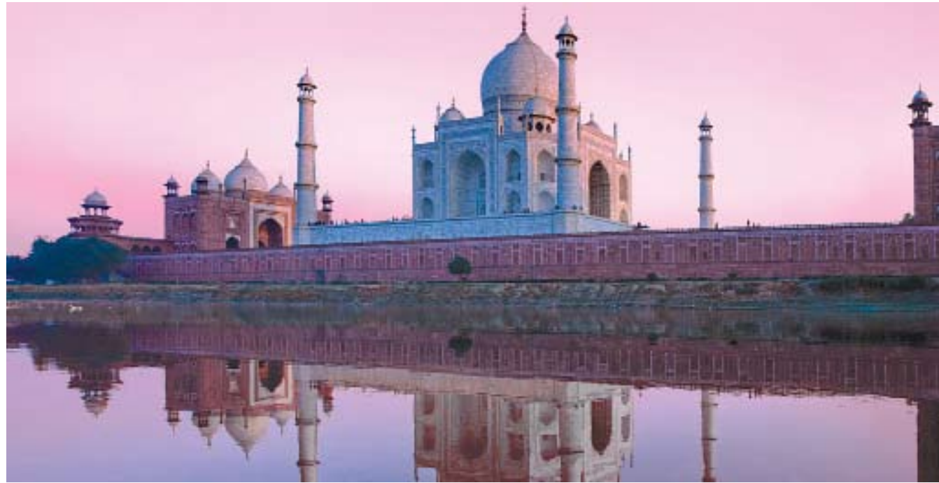
Taj Mahal, Agra

NEW DELHI ■ AGRA ■ RANTHAMBHORE ■ JAIPUR ■ UDAIPUR ■ MUMBAI