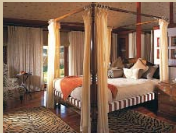
Richly appointed rooms await

The Oberoi's new luxury resort is adjacent to the famous Ranthambhore Tiger Reserve. Though the tiger is an elusive animal, sightings in the reserve are frequent. This resort has been designed as a "Jungle Camp," the first luxury jungle camp in India. Each of the 25 luxury air-conditioned tents have a private walled garden and private deck.